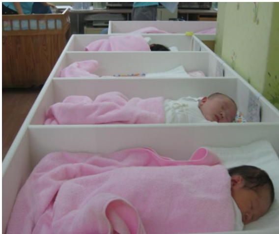
Babies at the Love the Children's Hospital in ESWS.